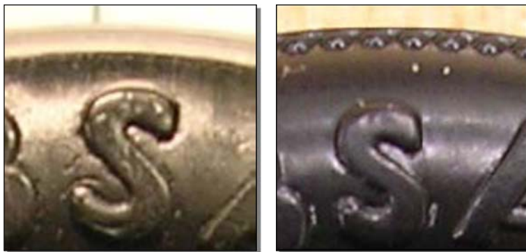
Figure 2 - Illegal and legal wheel modifications

much and the wheel is illegal (see Figure 2). No coverings (e.g. hubcaps) are allowed on the external hub side of the wheels as this would prevent inspection of the axles and wheel hubs.